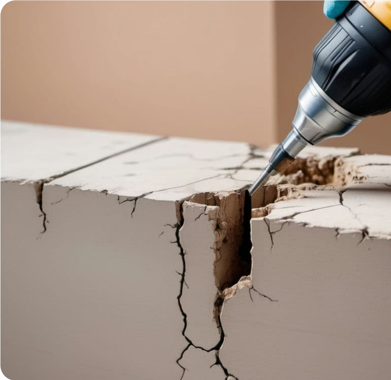
The Impact of Helical Piles on Construction Efficiency

These factors highlight the many advantages of making use of the helical piles , emphasizing their role in improving efficiency, sustainability, and cost-effectiveness in construction.